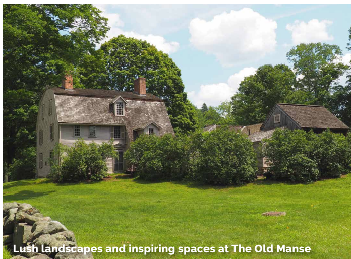
Lush landscapes and inspiring spaces at The Old Manse

Take a leisurely hike around Walden Pond and dedicate a few moments to quiet pondering at the original site of Thoreau's cabin (1) . A replica of the little house stands near the Visitor Center (2) .