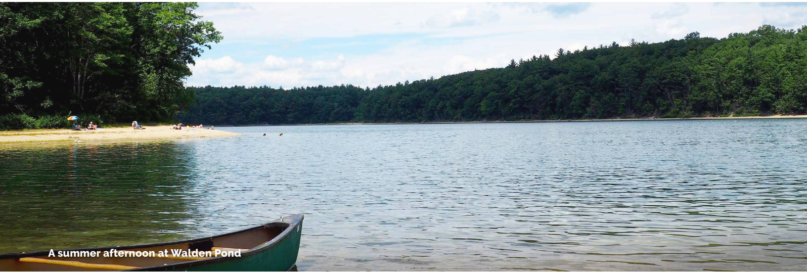
A summer afternoon at Walden Pond

Henry David Thoreau wrote Walden - his well-loved musings on nature, solitude, and mankind - during his time in a self-made shack at Walden Pond in Concord, Massachusetts. Today, Concord still breathes with the spirit of Thoreau. Go beyond the pond to these sites touched by the life and works of the influential writer, transcendentalist, and nature-lover.