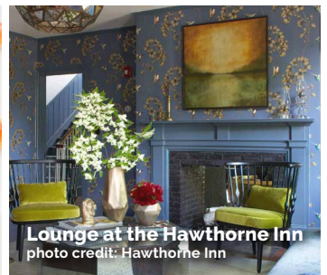
Lounge at the Hawthorne Inn