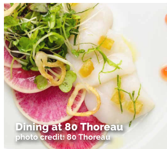
Dining at 80 Thoreau